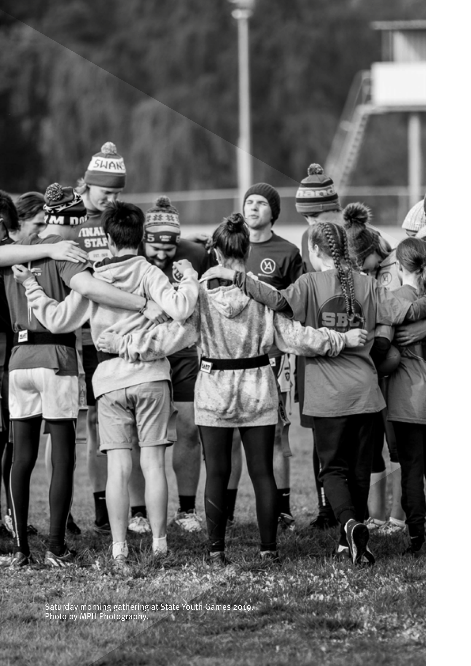
Saturday morning gathering at State Youth Games 2019.