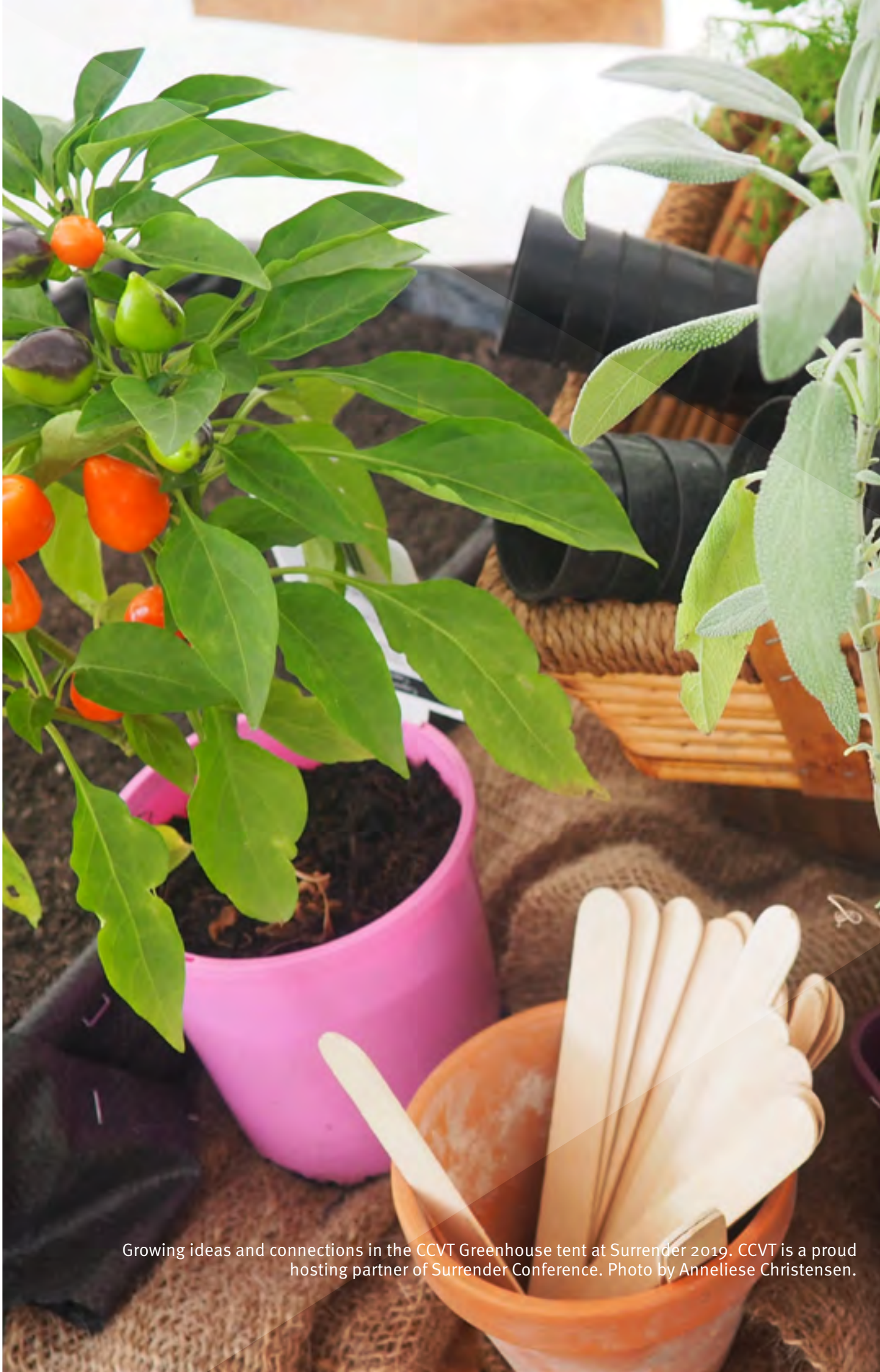
Growing ideas and connections in the CCVT Greenhouse tent at Surrender 2019. CCVT is a proud hosting partner of Surrender Conference.