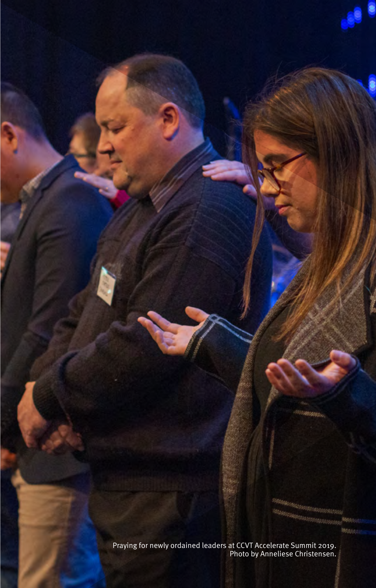
Praying for newly ordained leaders at CCVT Accelerate Summit 2019.