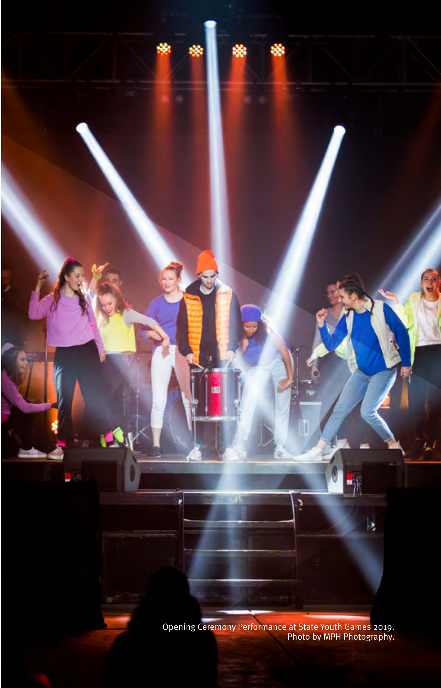
Opening Ceremony Performance at State Youth Games 2019.