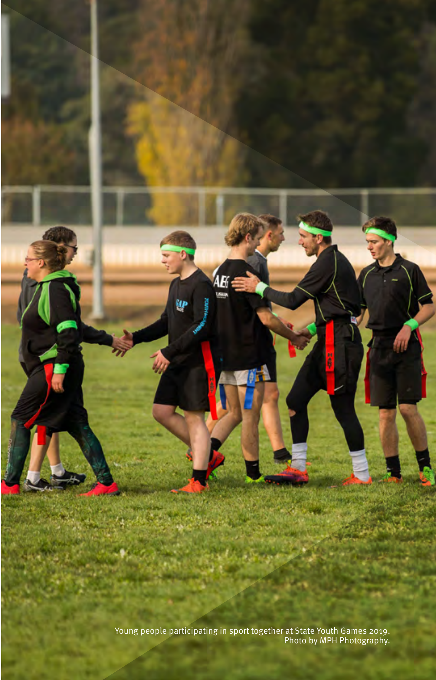
Young people participating in sport together at State Youth Games 2019.