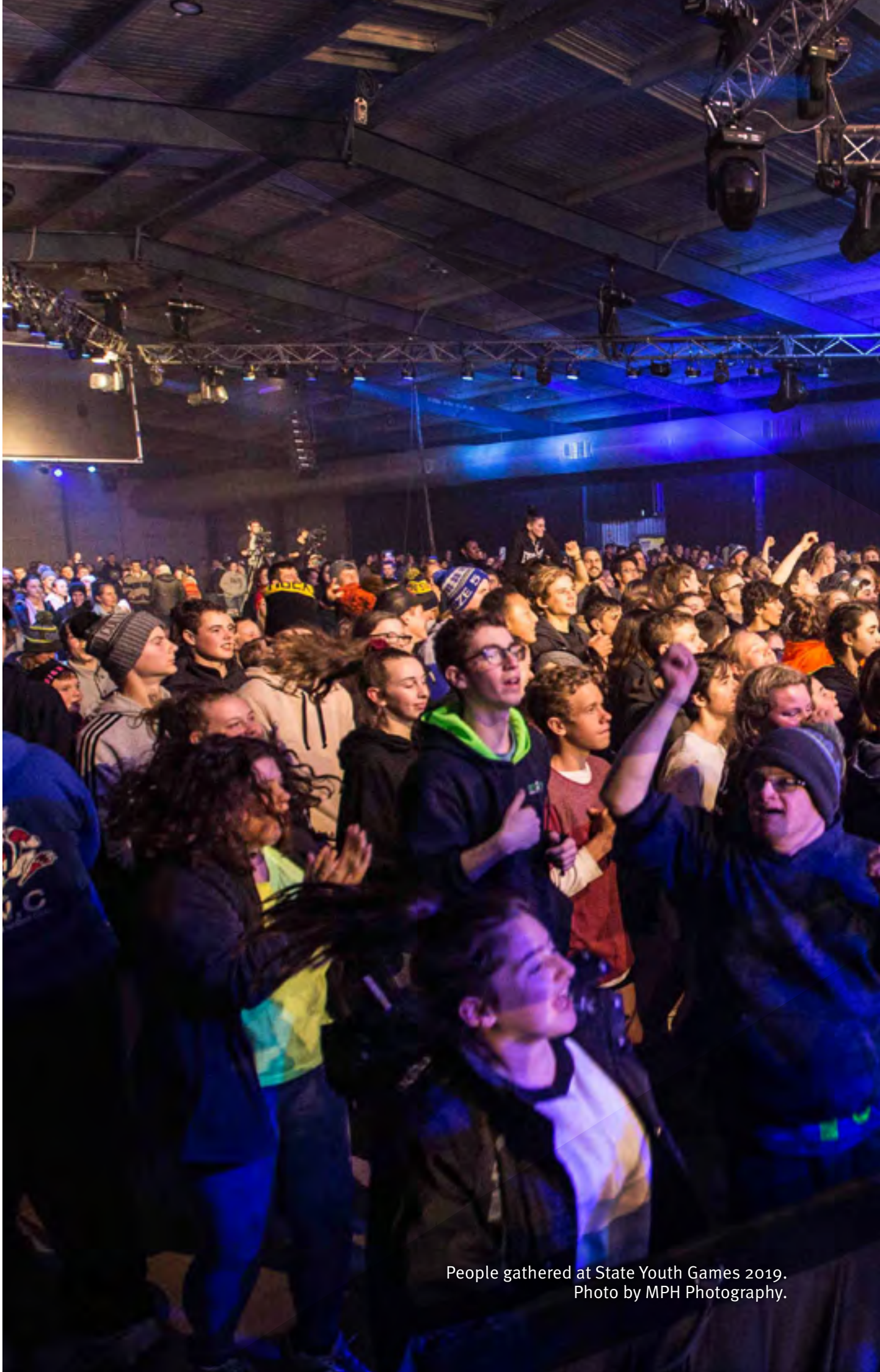
People gathered at State Youth Games 2019.