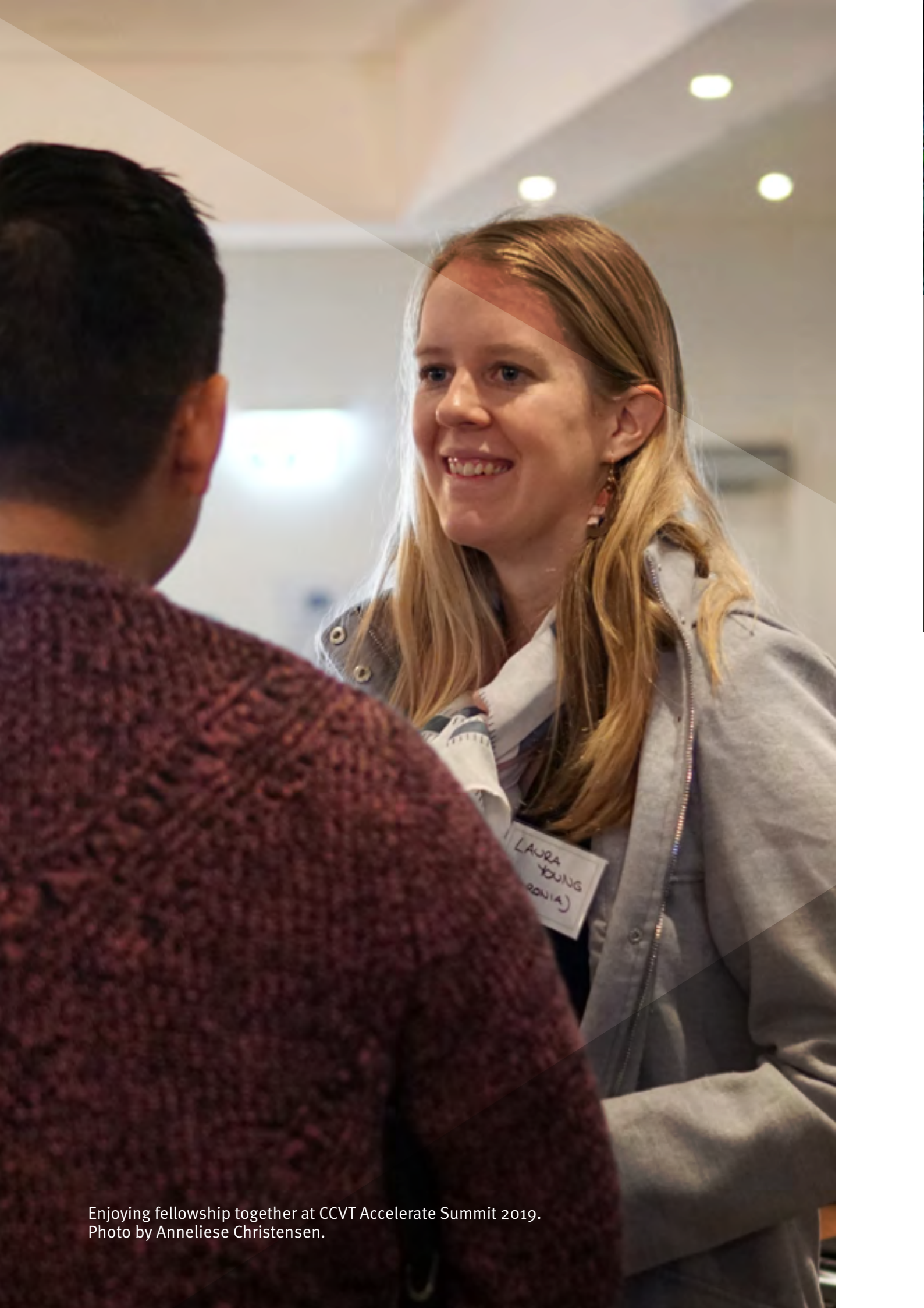
Enjoying fellowship together at CCVT Accelerate Summit 2019.